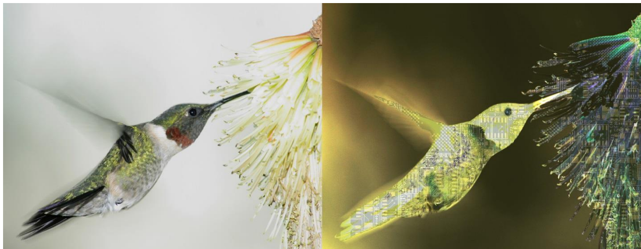
Figure 1: What makes the hummingbird hover? The underlying reason why the hummingbird has the ability to hover is due to active biological information which contains the essential specifications that are continually flowing through a labyrinth of information networks within the biological systems of the hummingbird. Biological information – which can only arise through intelligent input – is ultimately what allows the hummingbird to hover. The hummingbird on the right is shown overlain with a circuit board to illustrate the concept of biological information that makes life possible.

What enables a hummingbird to hover? Wings, feathers, energy from flower nectar – yes, certainly all of these are required. But even a dead hummingbird can have all these things. New developments in biology are revealing that the vital element which has so often been overlooked is active biological information. There is a massive amount of information in the hummingbird's genome – it contains the essential specifications needed to make a hummingbird what it is, and to make it alive. But biological information is much more than just the static information stored in the genome. Life is only alive if there is active biological information continuously flowing through a labyrinth of information networks within and between cells. These networks are like an internal Internet system within every cell. Information moves through these networks via multiple languages, using specified senders and receivers (most of which are molecules) – and these senders and receivers must “speak” the same language. There are millions of components within a cell that are in constant communication with each other.